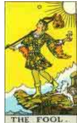
The April Fool

SimuPedia A WikiPedia for Building Simulation http://www.ibpsa-germany.org/index.php/Simupedia/en